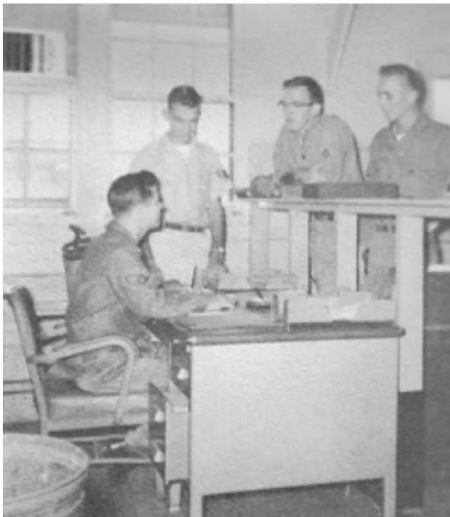
Radar crews getting equipment to complete job, Robins AFB, @1959.