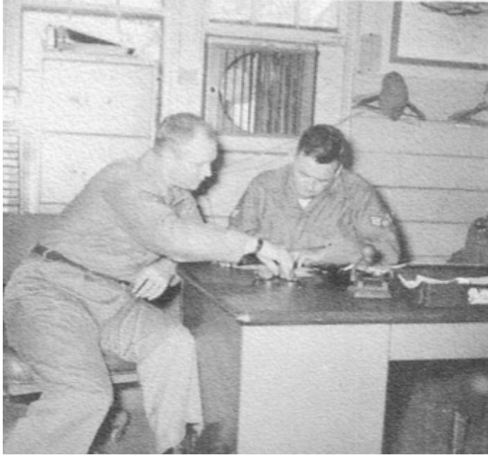
Researching information for use on the current UAL for GEEIA squadron, Robins AFB, @1959.